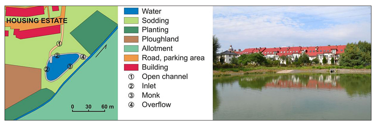
Figure 3. Location of sealed rainwater reservoir in the housing estate

The presented examples of rainwater management show that the city can change its image and become more environmentally friendly as well. These solutions enable to achieve nature aims (improvement of living conditions for plants and animals, stabilisation of water relations, mitigation of microclimate), economic (no need of construction